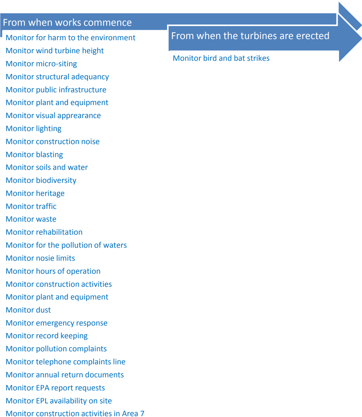
Figure 2: Illustrated plan showing monitoring during the works