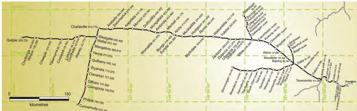
Figure 13.5 Western system rail network