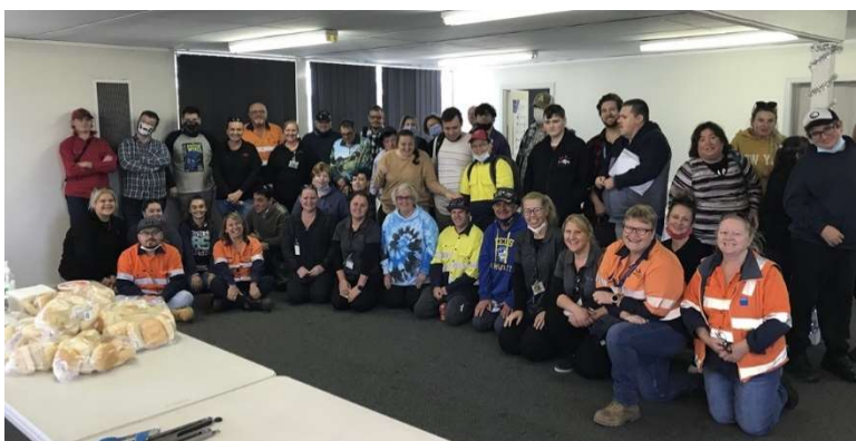
Caption: Our people at Bayswater and Liddell with Challenge Disability Services and Warrior Disability Services to celebrate IDPwD.

To connect with our local communities, an invitation was extended to Challenge Disability Services and Warrior Disability Services to celebrate International Day of People with Disability (IDPwD) 2021. Five buses were provided for each organisation to tour our Bayswater and Liddell Power Stations. We also enjoyed a BBQ at the conclusion of the tour.