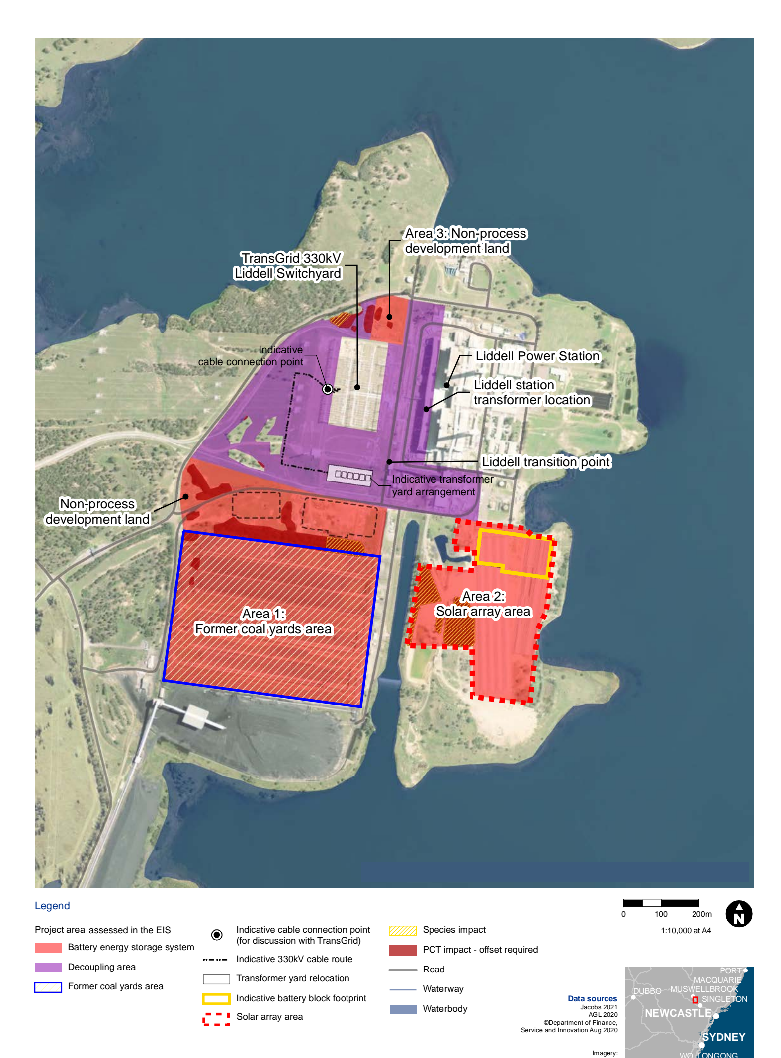
Figure 2 Overview of Stage 1 and 2 of the LBBAWP