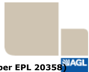
Table 1: Water quality monitoring points: Irrigation Program (as per EPL 20358)