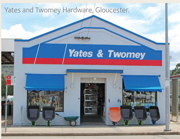
Yates and Twomey Hardware, Gloucester.