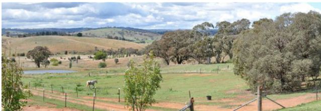
Photo Location Louise Duncan Residential Dwelling 053 Felled Timber Road- Existing view north east

The visual impact of the Project on surrounding properties will be reduced by using low visibility building materials and limited night time lighting.