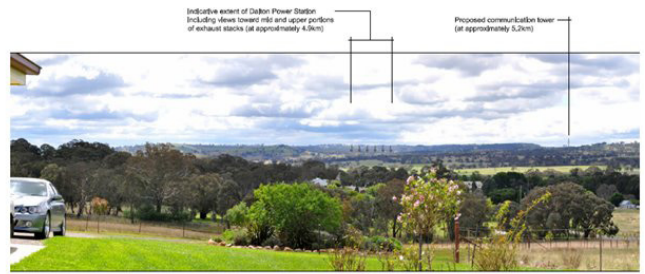
Photo Location Wayne Apps Residential Dwelling - Proposed view north to north east from Dalton South