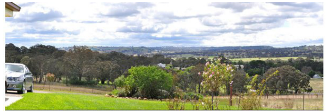
Photo Location Wayne Apps Residential Dwelling - Existing view north to north east from Dalton south