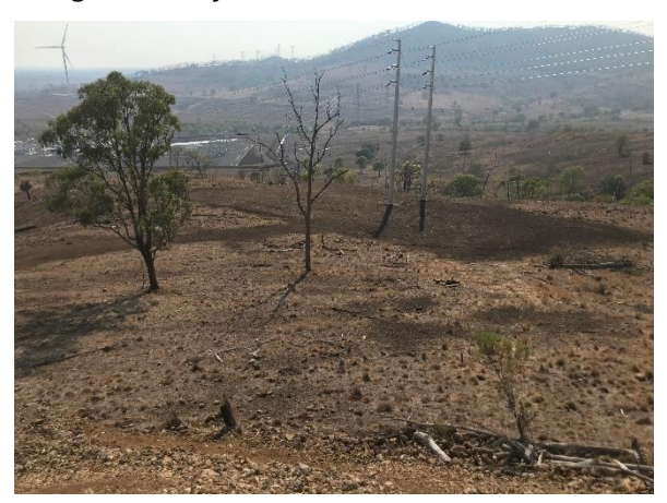
A total of 357 mm of rain fell in total which was significant and welcomed for local landowners in both Western Downs and South Burnett council areas and across the Coopers Gap Wind Farm.

In January 2020 over 100 ml of rain fell at Coopers Gap, this was quickly followed by 220mm of rain falling in February.