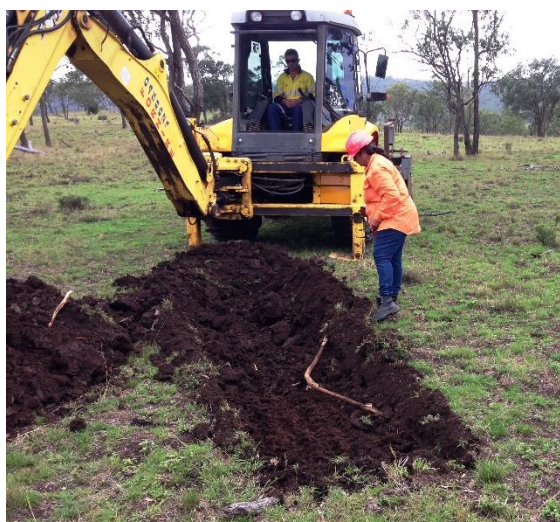
Picture: Aboriginal groups inspecting areas for artefacts during excavation.

The wind farm site sits on land where three Aboriginal groups have an interest; the Western Wakka Wakka People, the Barunggam People and the Wulli Wulli People. GE-CATCON and AGL have been engaging closely with all three groups prior to commencement of any ground disturbance work. The groups walk the access tracks, turbine foundation sites, laydown areas and inspect the areas with a high probability of artefact finds during excavation. Any object of Aboriginal Cultural Heritage significance found is collected, bagged, tagged and relocated in accordance with the Cultural Heritage Management Plans. These plans have been endorsed by each of the Aboriginal groups. The project will also be rolling out a Cultural Heritage awareness program to the crew on site during the construction phase.