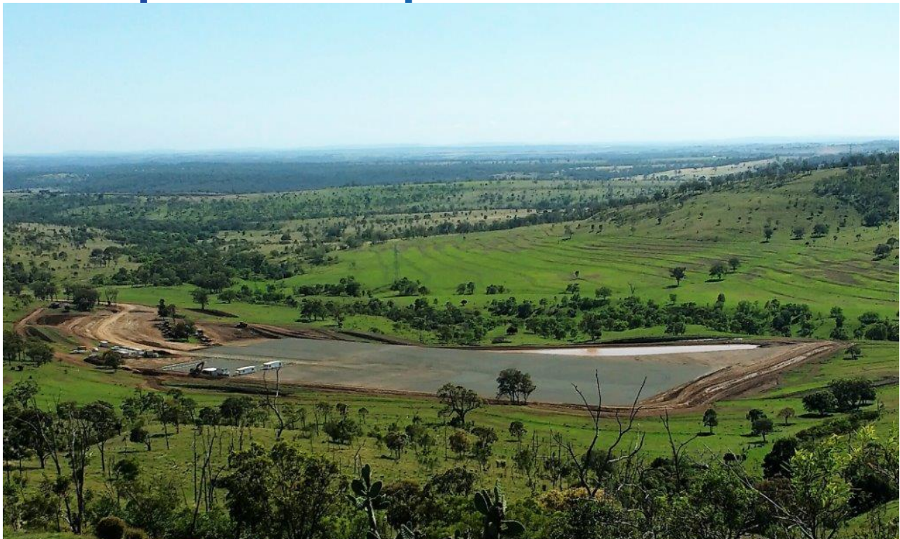
Completed Substation Bench

Coopers Gap Wind Farm is owned by the Powering Australian Renewables Fund (PARF).