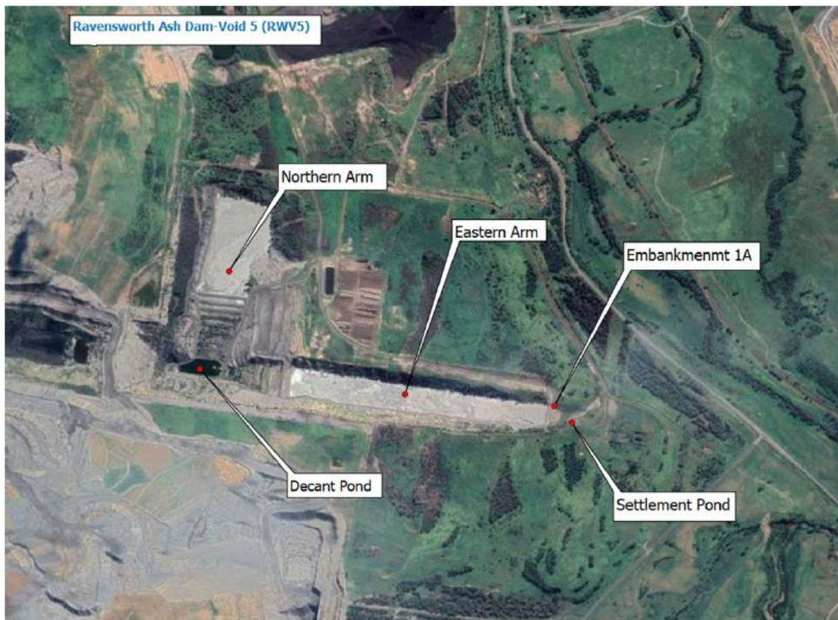
Figure 3 Aerial image showing the general arrangement of RWV5

The Ravensworth area is situated in the upper Hunter Valley, approximately halfway between the towns of Singleton and Muswellbrook adjacent to the New England Highway as shown in Figure 1