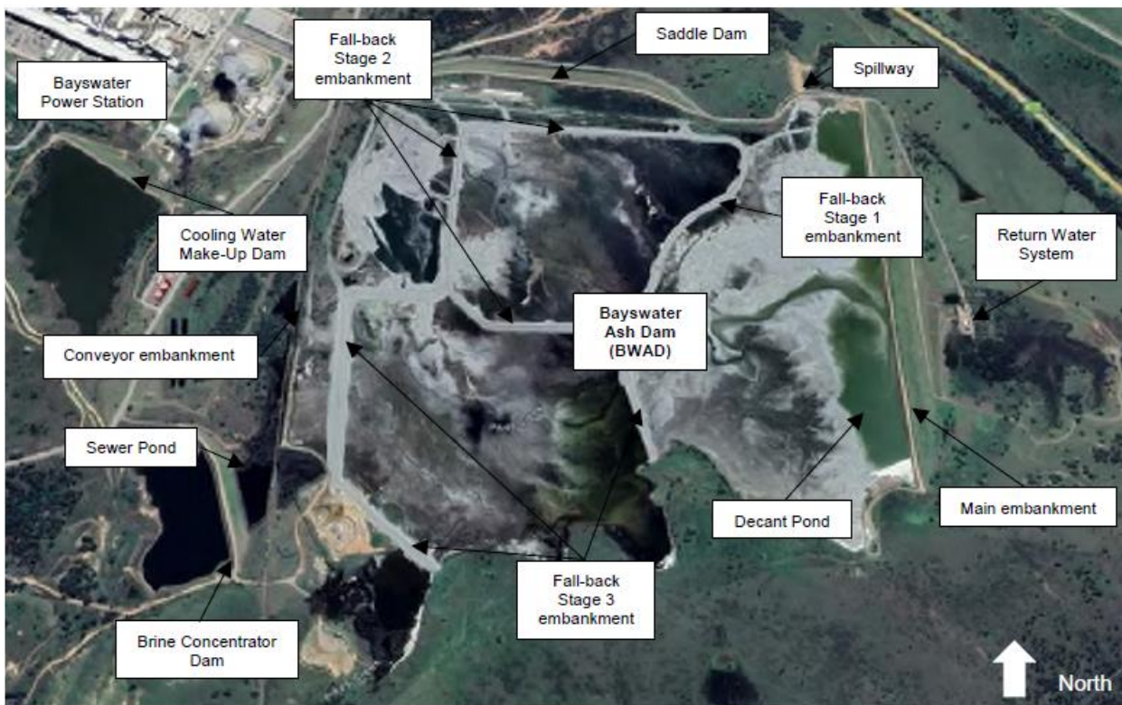
Figure 1 BWAD Site Plan (November 202 Google Earth Image)

The furnace ash including economiser grits are collected and crushed, then mixed with ash return water to create a suspension (slurry) and pumped to the north-western side of the dam. The bottom ash and fly ash is transported from the ash plant via above ground basalt lined pipes to a disperser located on a high point within the ash reservoir.