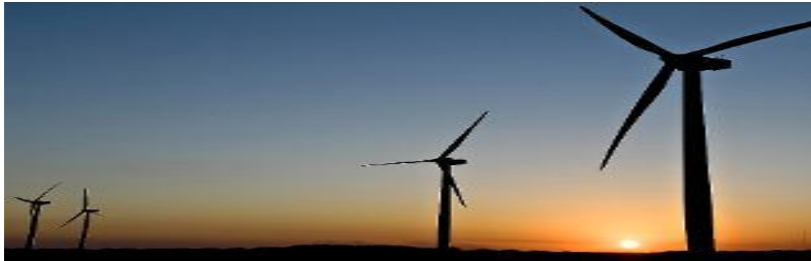
» Coopers Gap Wind Farm 17 March 2017