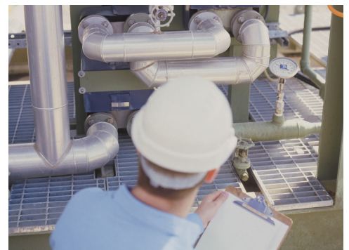
▲ An AGL employee monitors gas flows.

The Tomago industrial area is AGL's preferred site for the GSF as it is appropriately zoned for this type of development and is near Newcastle, a major gas demand centre. Refer to the map on the next page.