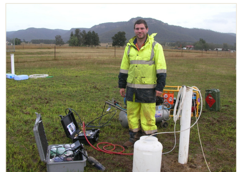
▲ Angus from Parsons Brinckerhoff collecting groundwater information.

The three primary aquifer systems (the sandstone aquifers and the coal measures) are separated by low permeability claystone aquitards 1 . Available water quality data suggests distinct differences in water chemistry and isolation of each of these aquifer zones. The Illawarra Coal Measures have higher fracture related permeability (compared to surrounding rocks) and are sometimes termed coal seam aquifers , although they are in fact mostly low