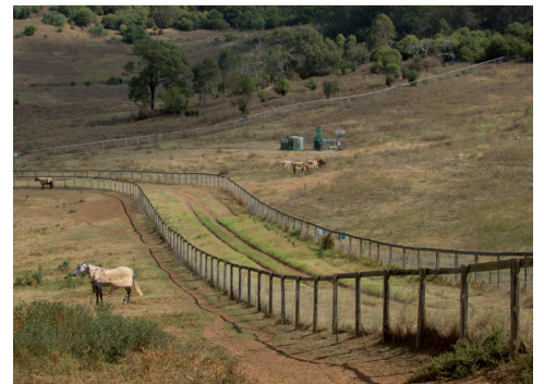
▲ Co-existence with livestock.

The well is drilled vertically from the surface and gradually angles out to intersect parallel with the coal seam. Once the coal seam is intersected, the upper portion of the well bore is cased, cemented and a smaller hole is subsequently drilled through the casing and horizontally into the seam for approximately 2,500m. This technique allows a significant reduction in the number of surface locations along with the ability to access previously stranded gas reserves more than 2,500m away from the well surface location.